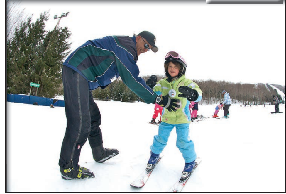
Elk Mountain Ski Instuctor

Skiing and snowboarding are lifetime sports. Your keys to a fabulous winter