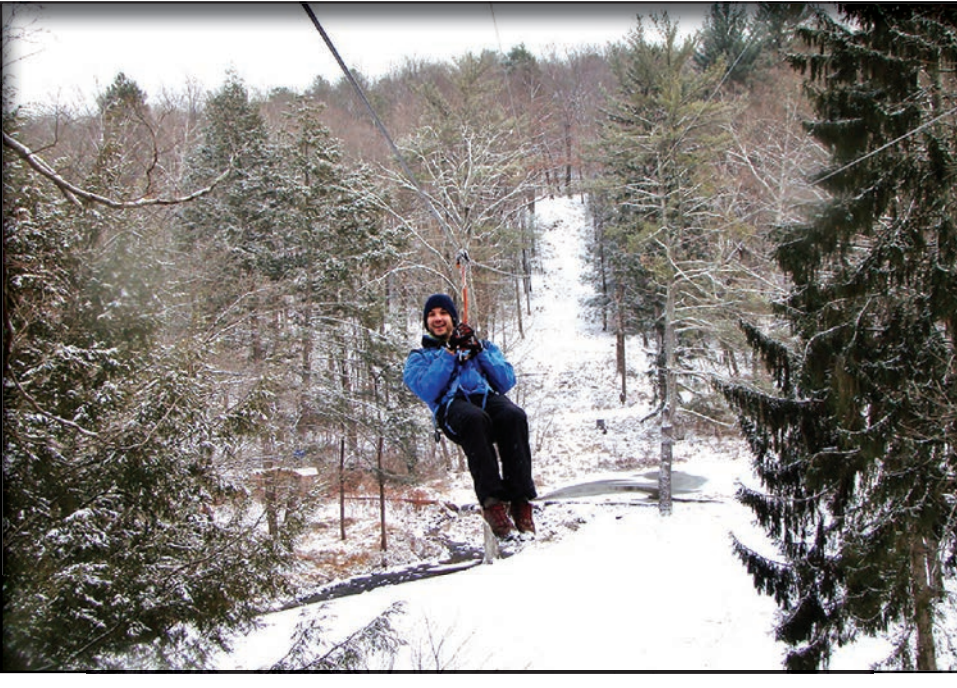
Pocono TreeVentures Enjoy the Zip Line from the top