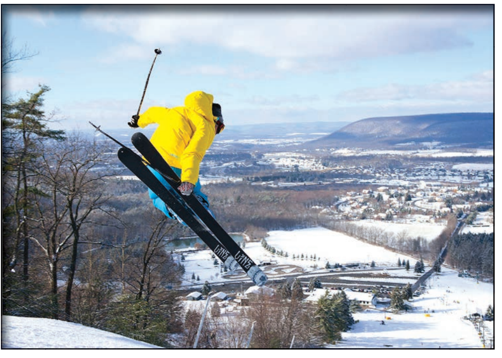
Tussey Mountain Ski Resort