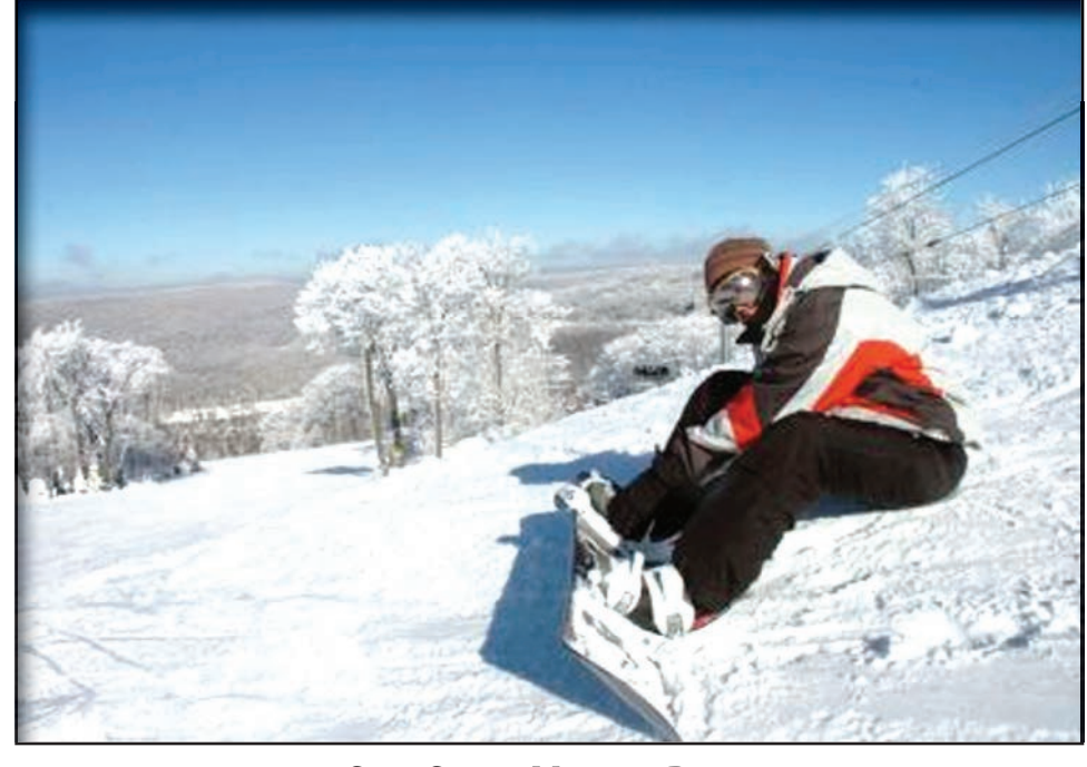
Seven Springs Mountain Resort

And, a 900-foot string of nine snowmaking towers has been added to expand the size