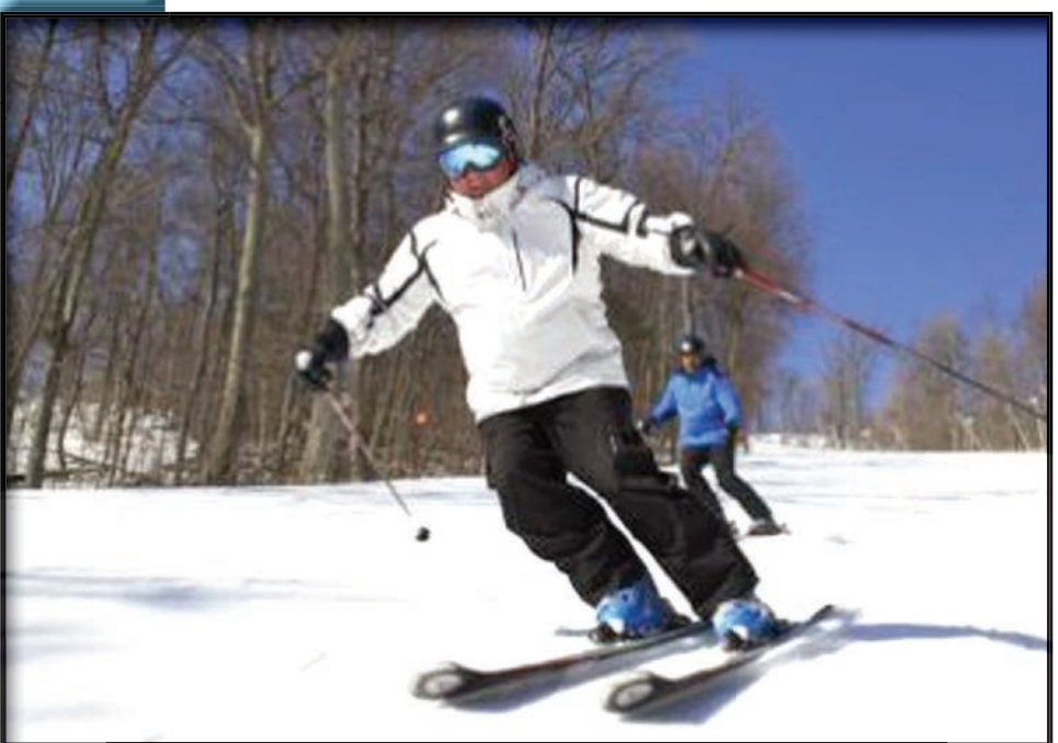
Liberty Mountain Resort