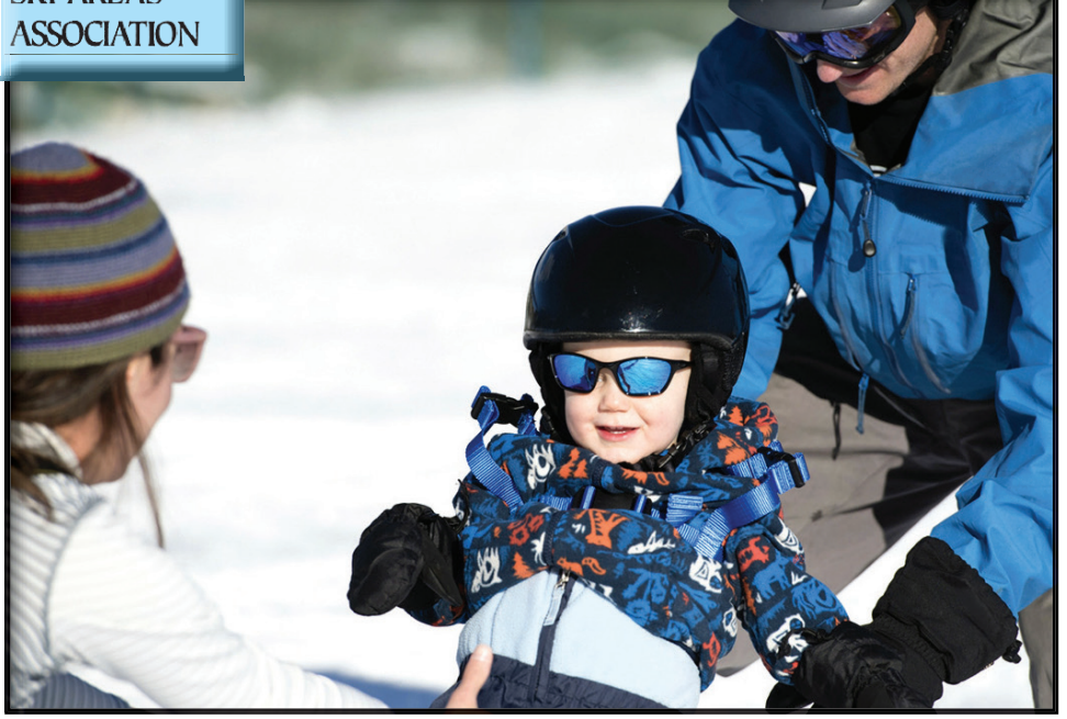
Blue Mountain Kids Ski School