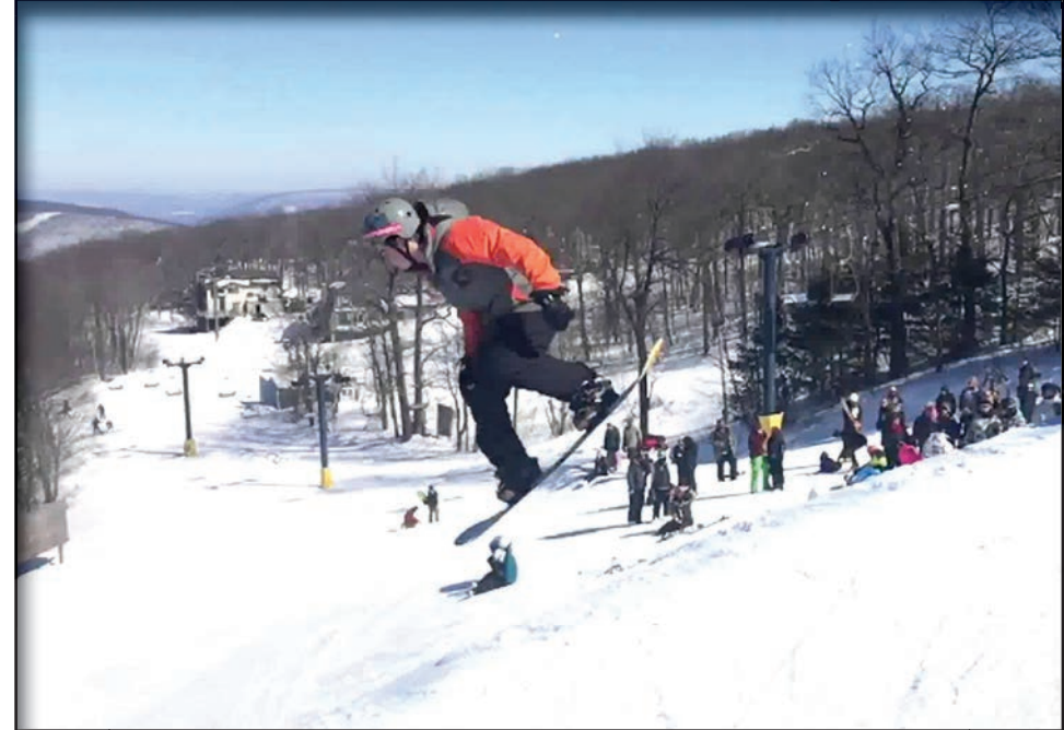
Blue Knob Mountain Resort

added "winching" attachment, which enables the snow cat to groom and push snow uphill. Finally, the resort is offering an exclusive ice skating season pass for $75, which provides unlimited ice time and skate rental anytime the rinks is open. For more information, visit, http://www.libertymountainresort.com.