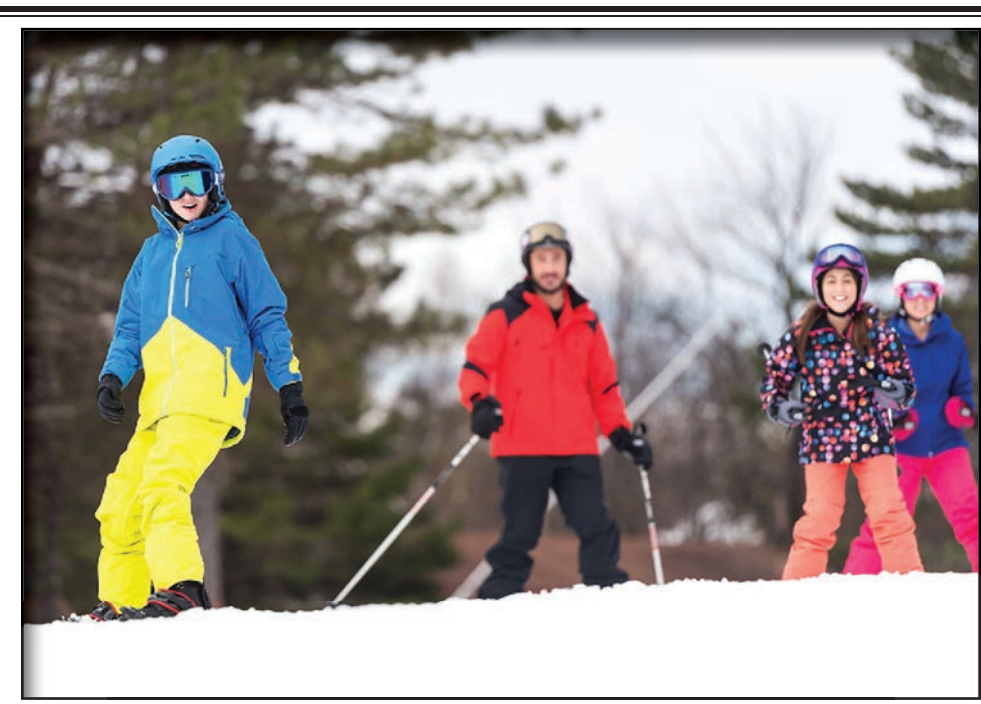
Family of Skiers on Camelback Mountain