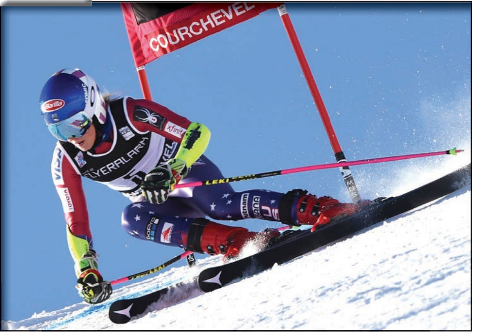
United States's Mikaela Shiffrin competes during an alpine ski, women's World Cup giant slalom in Courchevel, France, Tuesday, Dec. 19, 2017.

COURCHEVEL, France — Mikaela Shiffrin is getting more aggressive in defense of her World Cup and Olympic titles.