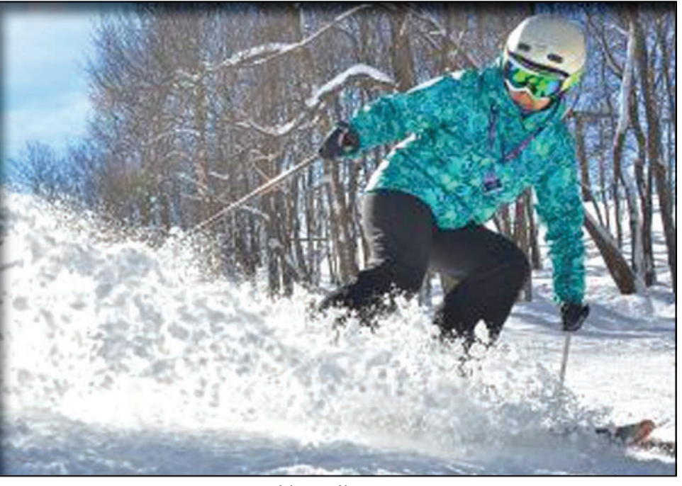
Hidden Valley Resort

of North Park, which has been redesigned into a broader crossstyle freestyle area, full of small and medium features, bank turns and transition. Nighttime ski enthusiasts can look forward to a new night ticket this year, available Sundays through Thursdays, from 4 p.m. - 9 p.m. Seven Springs has also added to its rental center with the addition of a brand new fleet of Rossignol children's ski and boots and Burton snowboards and boots. Finally, many improvements have been made or are underway off the mountain, too. The Center Lobby and Bavarian Lounge are being completely renovated with updated flooring, finishes, accents and furnishings. The Bass Rock Cottage, located adjacent to the resort, has been completely renovated and is now available for reservations. The cottage sleeps eight and offers luxurious yet rustic accommodations with a private fishing pond and breathtaking views. The Seven Springs hotel is also being renovated. And, the resort's main parking lot is undergoing a major upgrade including new lighting,